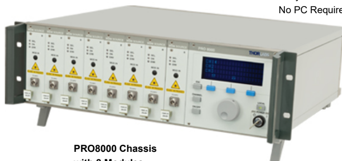
PRO8000 Chassis with 8 Modules

Easy to Read Display No PC Required for Operation