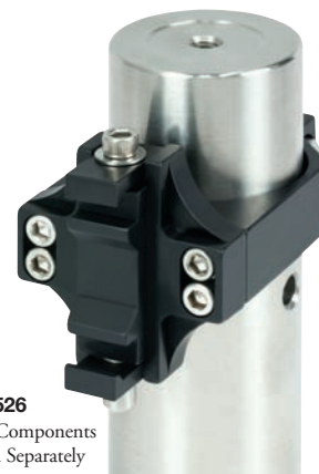
C1526 All Components Sold Separately

The C1026 and C1526 Post Cage Adapters were designed to mount our 30 mm Cage Assemblies securely to our Ø1.0" (Ø25 mm) and Ø1.5" Mounting Posts. A quick-connect mechanism on the front of the clamp is activated by a single hex wrench for fast drop-in/drop-out of the cage assembly from the clamp. A 3/16" (5 mm) hex clamping screw is located on the rear of the clamp to allow the user to easily install and remove the entire clamp from the post while keeping the cage system intact.