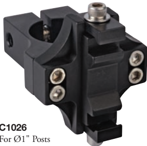
C1026 For Ø1" Posts