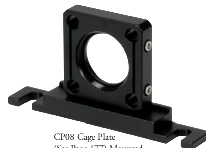
CP08 Cage Plate (See Page 177) Mounted on a CPB1

The CPB1 Cage Plate Mounting Base offers a low-profile, high-stability solution for mounting 30 mm Cage Plates directly to an optical table or breadboard containing 1/4"-20 holes located on 1.00" centers (M6 x 1.0 holes on 25.0 mm centers for metric tables and breadboards). An optical axis height of 1.15" (29.2 mm) will be maintained throughout the system.