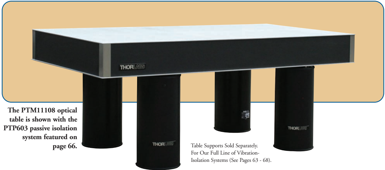
The PTM11108 optical table is shown with the PTP603 passive isolation system featured on page 66.

The Standard Series of tabletops is ideally suited for less demanding general photonics applications but would not be recommended for highly sensitive interferometric applications.