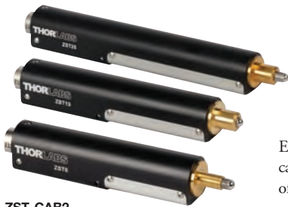
ZST-CAB2 Cable Included with Purchase of Actuator

Our ZST actuators provide smooth, precise, linear motion control in a compact package. Powered by a small-diameter, dual-phase stepper motor, these actuators operate at speeds up to 0.5 mm/s and are capable of moving loads of up to 12 lbs. Mounting options include a high-tolerance Ø0.375" mounting barrel for fastening into any application compatible with our precision micrometer heads (see pages 599 – 603), including our popular PT1 translation stages. A 1/4"-80 threaded barrel is also offered for use with any standard manual mirror mount using 1/4"-80 threaded adjusters.