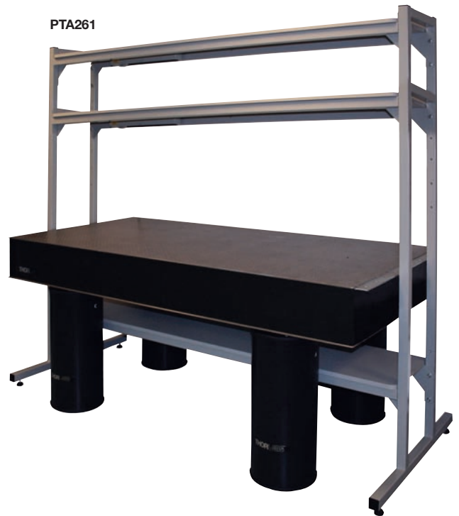
Power Strip Included. Four Options Available